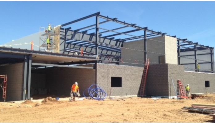
Work continues on the new Wolf River Lutheran High School next to Boarders Inn at the Highways 22 and 29 intersection.

Nelson Services is known for performing construction, tree-cutting and boat storage among other area projects.