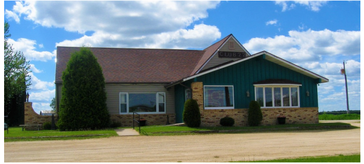
Club 22, located on Highway 22, serves diners Tuesday through Sunday, 4:30 p.m. to close. It is closed Monday.

Prime rib is featured Wednesdays and Saturdays and all-you-